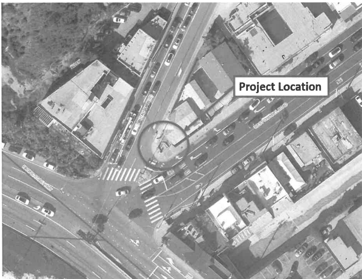
Figure No. 1: Project Site Location

the existing ejector pot system and installing a wet well with two soft-start compatible submersible pumps. Equipment such as the inlet valve, check valve, discharge valve, Programmable Logic Controller/Local Control Panel and level sensor instrumentation, Motor Control Center switchgear, a sluice gate, access ladders, platforms, and entrance hatches will be replaced.