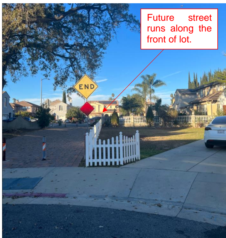
Figure No. 2: Street view of future street area at 7862 Laramie Avenue.