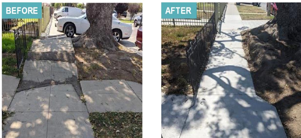
Figure No. 1: Broken/Uneven sidewalk remediated at 524 W. 91 st Street.

On July 1, 2022, the Board authorized the City Engineer to issue TOS No. 7A to HDR for program management support, design, and construction management services for the SRP (Transmittal No. 1). The SRP is a 30-year, $1.4B program that implements the City of Los Angeles' (City's) obligations to repair pedestrian facilities fronting City facilities, performs general program access improvements, and completes requests received from those with mobility disabilities. Currently in Year 7, the SRP minimum annual commitment towards SRP-eligible expenditures is $35.743M. Figure No. 1 is a representation of a barrier which was designed and addressed under TOS No. 7A.