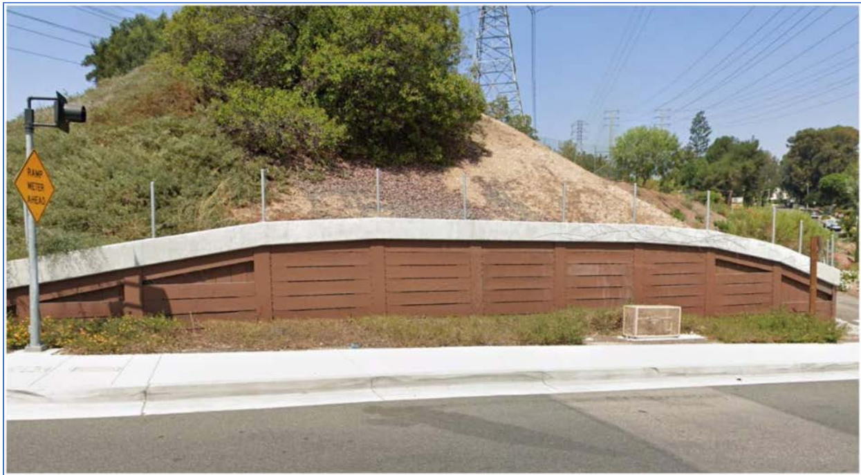
Figure No. 2 - Photo of Similar Constructed Bulkhead