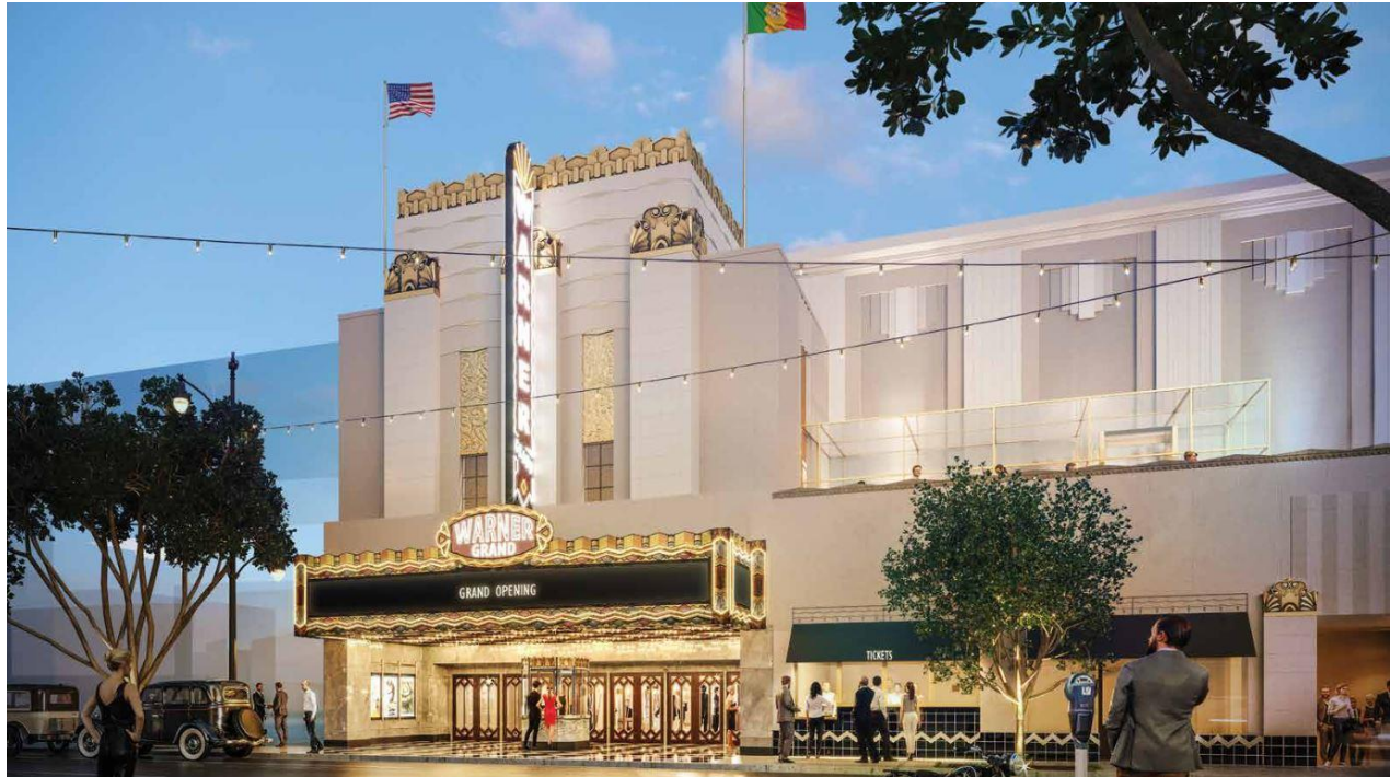
Exhibit A - Rendering: Street Front View

The contract duration is 500 calendar days.