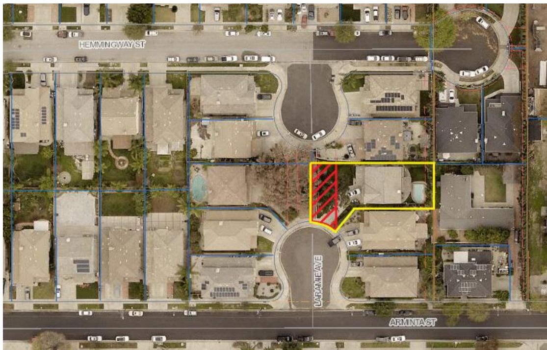
Figure No. 1: Aerial view of future street area at 7862 Laramie Avenue.