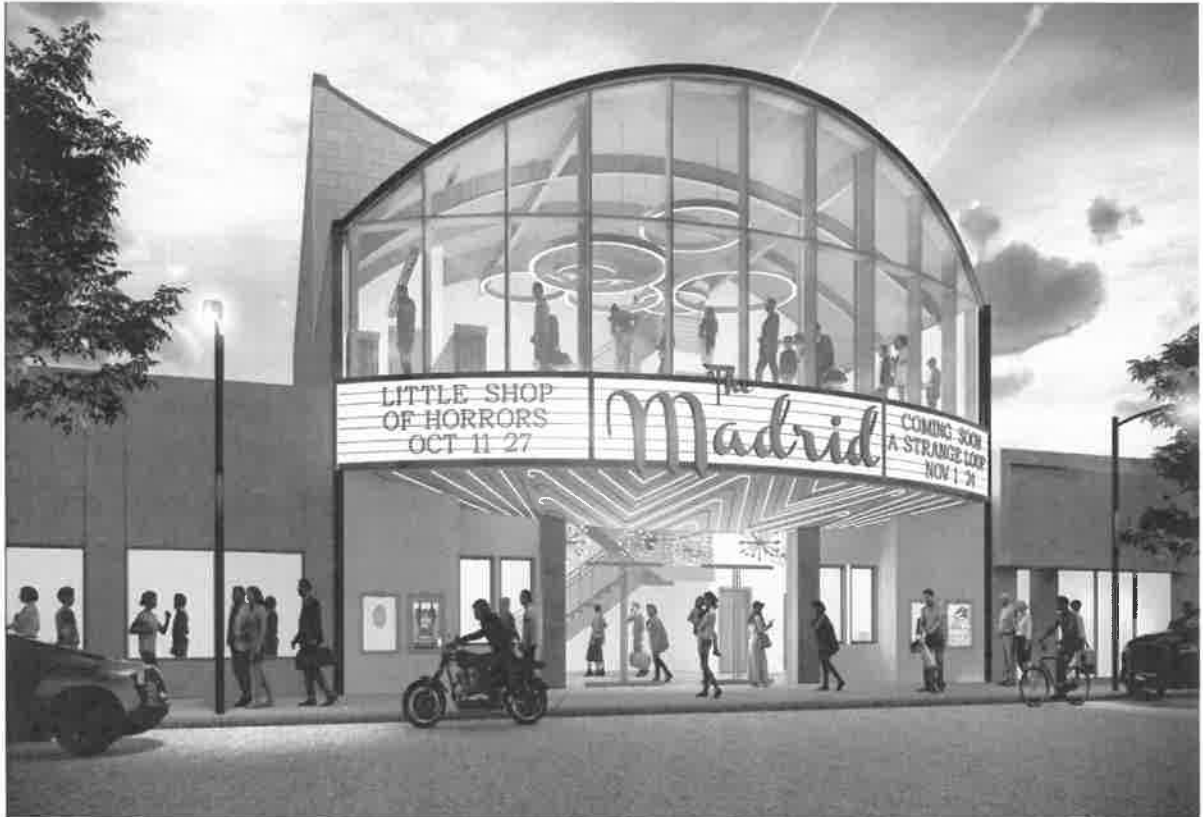
Figure No. 1 - Madrid Theatre Façade Rendering

On September 28, 2022, the Board awarded a contract to Waisman Construction, Inc. (Waisman), in the amount of $10,743,000 with a contingency amount of $2,172,698.96 for a total approved construction budget of $12,915,698.96 to construct the Project (Transmittal No. 1).