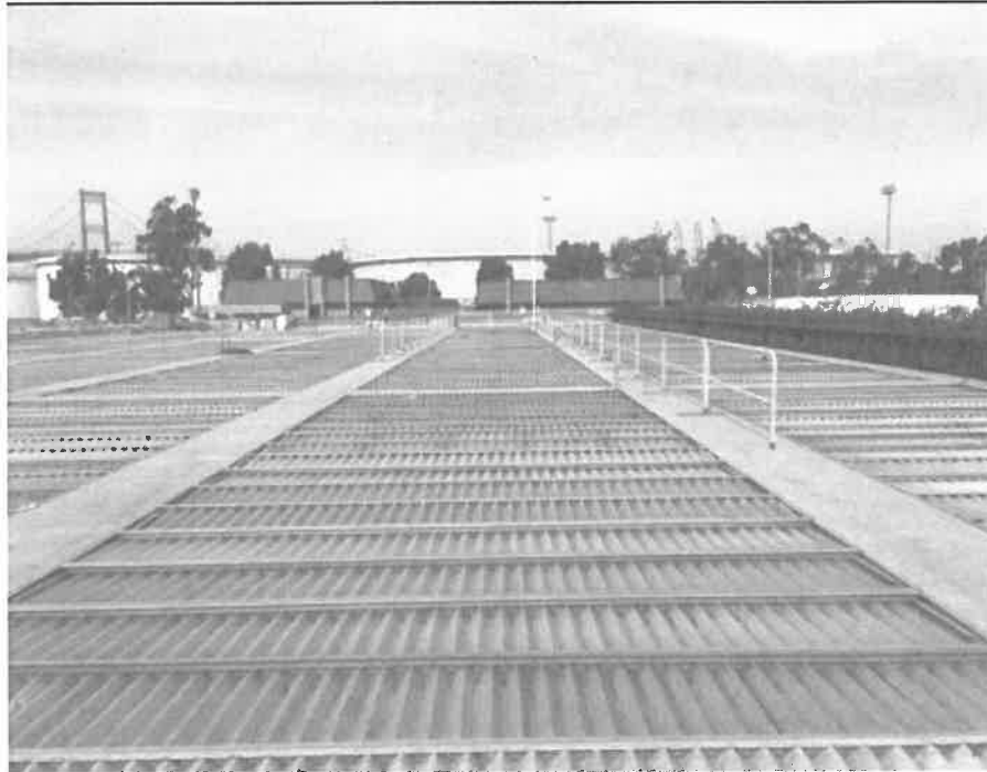
Figure No. 1 - Primary sedimentation tanks at the TIWRP.

The primary treatment facility includes six rectangular primary sedimentation tanks. Inside each primary sedimentation tank, sludge settles to the bottom, and a sludge collector mechanism composed of traveling chains and flights drags the sludge to two hoppers located at the bottom inlet end of the tank. Sludge is then pumped from the hoppers to the sludge blending tank from which it is transferred to the digestion facility.