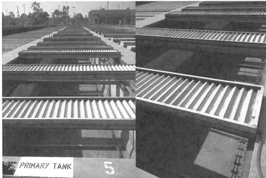
Figure No. 2 - Covers at primary sedimentation tanks at the TIWRP.