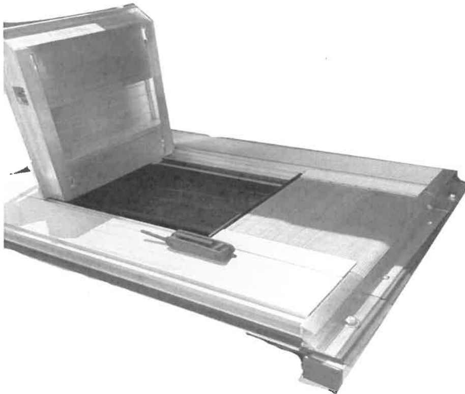
Figure No. 4 – Hatch covers for primary sedimentation tanks

Based on extensive evaluation, Hallsten has the experience, technology and proven performance record to supply covers to successfully replace the existing covers at a competitive price with added benefits.