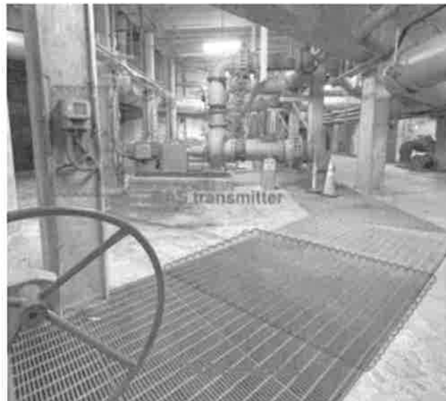
Figure No. 2: RAS Flowmeter