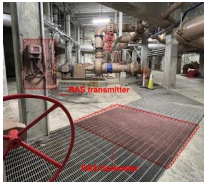
Figure No. 2: RAS Flowmeter