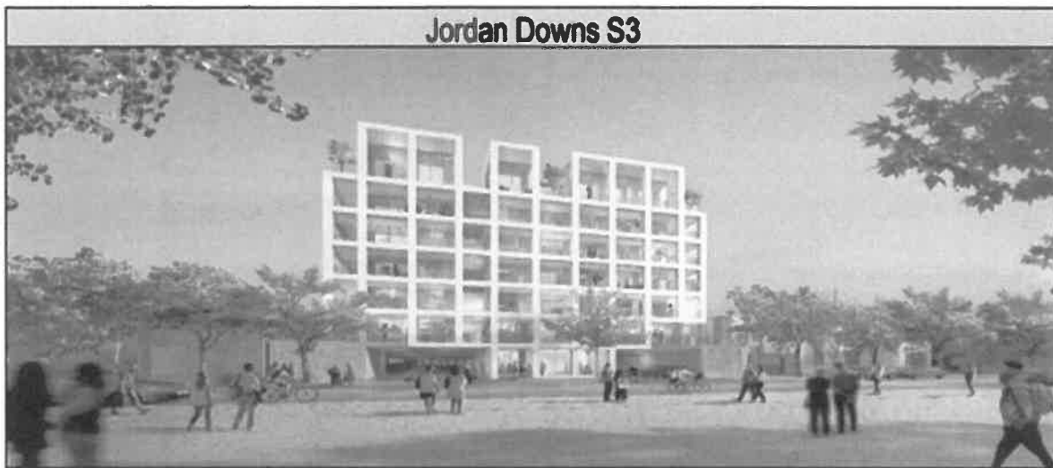
Figure No. 1: Jordan Downs S3 Development

The Project has been reviewed for environmental considerations. It was determined to be categorically exempt pursuant to the provisions of the California Environmental Quality Act (CEQA) of 1970 under Article III of the City's CEQA Guidelines.